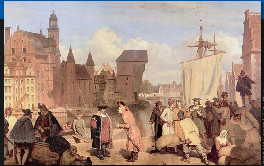
Wojciech Gerson (1831-1901)